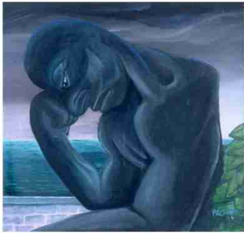
දෙවන කොටස ලබන කලාපයේ....

මෙම පරිච්ඡේදය තුළ ඊශ්‍රායෙල් ජනතාවගේ පුද්ගලික හා සාමූහික වේදනාව පෙන්වා දෙයි. එය පිටුපස ඇත්තේ දේව විනිශ්චයයි. පුරාණ ගිවිසුම තුළ දේව විනිශ්චයේ භාජන ලෙස විවිධ ජාතින් දෙවියන්වහන්සේ උපයෝගී කර ගනියි. තවද දේව විනිශ්චයට ලක්වන ජනතාව තුළ ඇතිවන හැඟීම්, ආකල්ප හා වේදනාව මෙම පරිච්ඡේදය පෙන්වා දෙයි. එය මුද්‍රා ගර්භයටම බලපාන බවත්, ඉන් අප පිවිතයේ කිසිම අංගයක් ආවරණය නොවන බවත්, මෙම පරිච්ඡේදයෙන් කියැවේ.